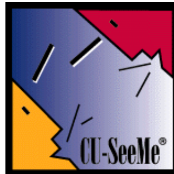
CU-SeeMe Video Conferencing System