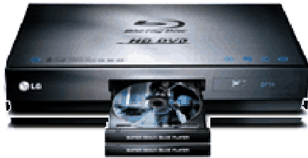
LG BH-100 Winner: Best of CES 2007